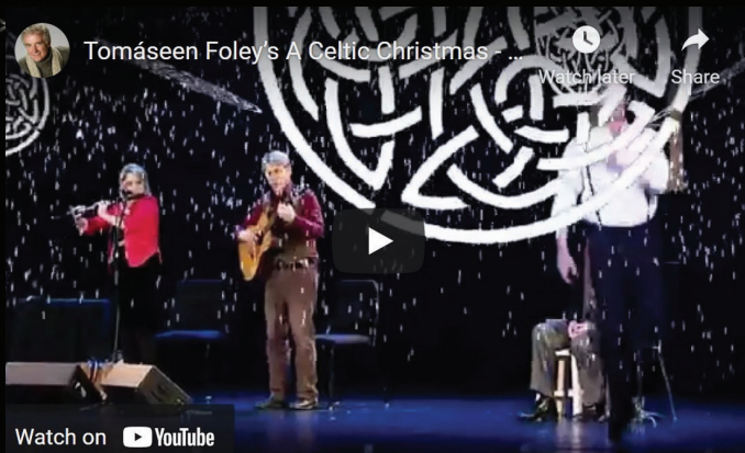
30-Second Promo Video